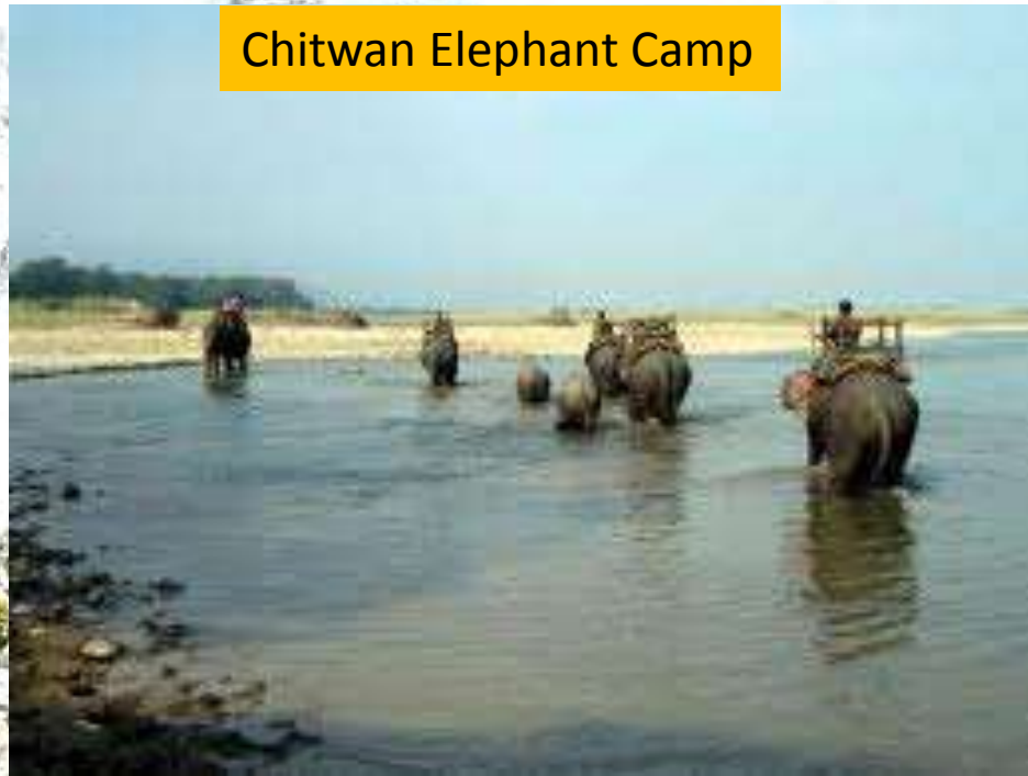
Chitwan Elephant Camp